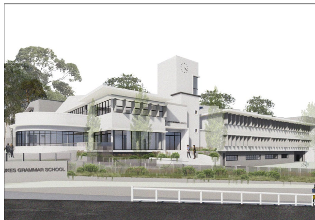
Artist impression: 800 Pittwater Road